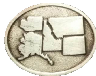
WWAMI Pro Pin