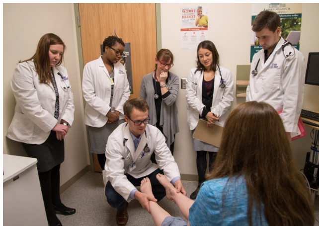
E-16 Alaska WWAMI Students

The Foundations Phase is an 18-month period consisting of interdisciplinary block courses that integrate the basic sciences, clinical medicine, and social sciences. It replaces the traditional discipline-based first-year curriculum and organ-system based second-year curriculum. Students complete the entire Foundations Phase at their home University (University of Washington, Gonzaga University, University of Wyoming, University of Alaska Anchorage, Montana State University, and the University of Idaho). Read more.